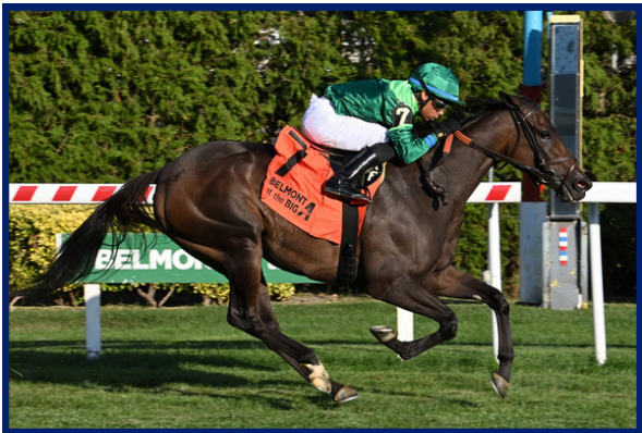
SHADE OF PALE breaks her maiden on the NYRA Circuit.

Last Race: 4/19/25 N1X @ TAM Finish: 2 nd by a neck Trainer: Chad Brown Conditions Left: ALWN1X Preferred Surface: TURF