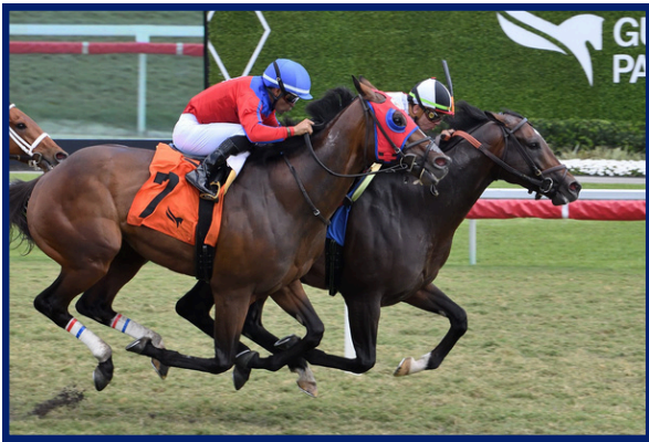
CLEVER MISCHIEF comes to the sale off of win at Gulfstream!

Last Race: 3/1/25 N1X @ GP Finish: 1 st by a neck Trainer: Chad Brown Conditions Left: ALW-N2X Preferred Surface: TURF