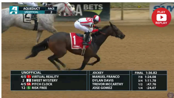
VIRTUAL REALITY a last out winner at Aqueduct on April 14th.

Last Race: 4/14/24 - ALW-N1X Finish: 1st Trainer: Chad Brown Conditions Left: N2X Preferred Surface: DIRT