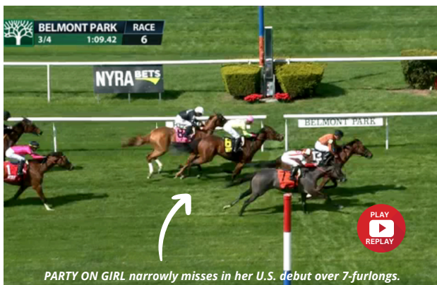
PARTY ON GIRL narrowly misses in her U.S. debut over 7-furlongs.