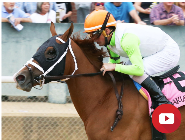
MYSTIC PLEASURE breaks her maiden at Oaklawn in her 2nd start.

MYSTIC PLEASURE broke her maiden in her 2nd start as a 3yo going 6-furlongs on the dirt at Oaklawn. She is a beautiful daughter of GOOD MAGIC and brought $210,000 when purchased as a Keeneland September yearling. She is out of the G2W/G1P DISPOSABLE- PLEASURE who is now a producer of 100% winners from her 3 foals to race.