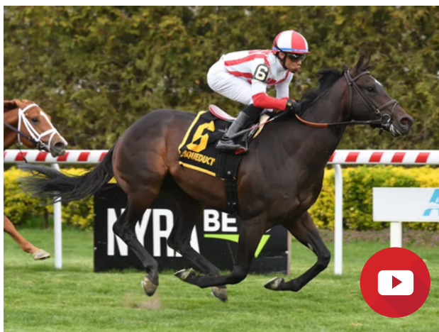
Unanimous Consent wins the Woodhaven Stakes at Aqueduct.

Last Race: 11/3/23 N3X @ BAQ Finish: 4th Trainer: Chad Brown Conditions Left: N3X Preferred Surface: Turf