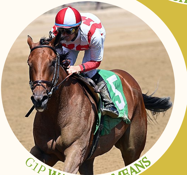
GIP WAYS AND MEANS