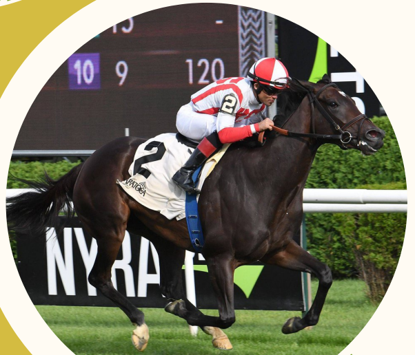
MGSW SURGE CAPACITY