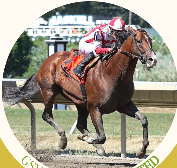
GSW HIGHLY MOTIVATED