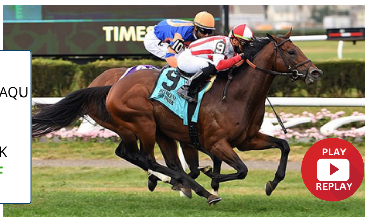
PUBLIC SECTOR - Multiple Graded Stakes winning son of KINGMAN

Last Race: 10/3/23 N3X @ AQU Finish: 5th Trainer: Chad Brown Conditions Left: N3X/STK Preferred Surface: TURF