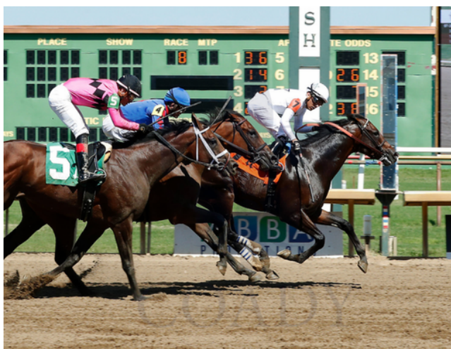
PENSACOLA breaks his maiden in his 1st start in 2023.