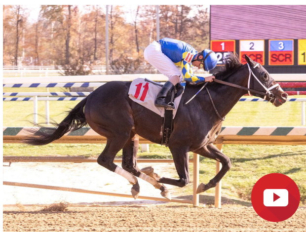
MURRAY winning by 4+ lengths on November 2nd, 2023 at LRL