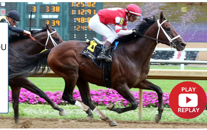
Manciata d'Oro a winner on DIRT and TURF

Conditions Left: N3X/STK Preferred Surface: DIRT