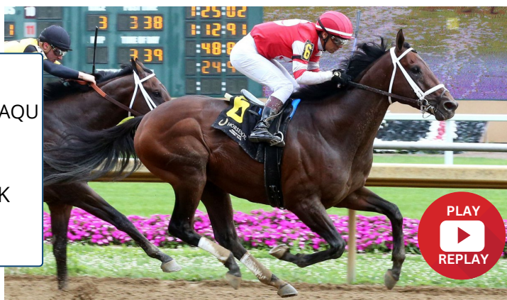
Manciata d'Oro a winner on DIRT and TURF