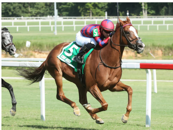
KING VEGA wins the Buckland Stakes at Colonial.