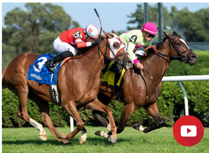
Anna Karenine wins a first level allowance at Saratoga