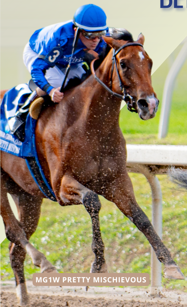
MG1W PRETTY MISCHIEVOUS