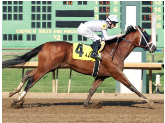
TSHIEBWE wins by 7 at Ellis Park

Last Race: 6/10/23 MCL100 @ ELP Finish: 1st Trainer: Todd Pletcher Conditions Left: N1X Preferred Surface: Dirt