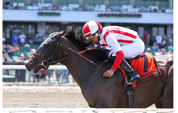
Power in Numbers winning the Tale Of The Cat Stakes

Following his allowance win he came back in just over three weeks in the Tale Of The Cat Stakes. He showed a new dimension in his win as he came from off the pace after breaking a step slow earning a 4 1/4 Thoro-Graph.