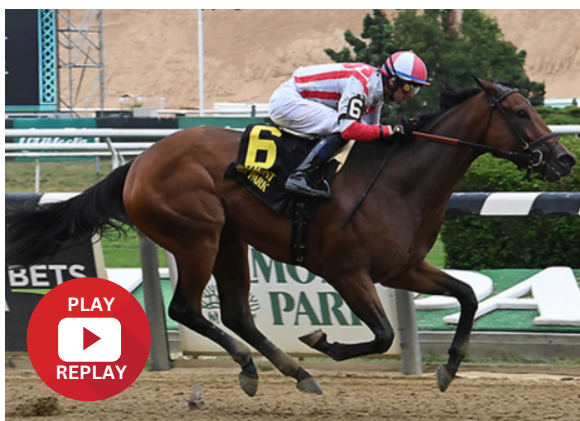
PITCH CLOCK is a determined winner last time out at Belmont.

Last Race: 6/23/23 MSW @ BEL Finish: 1st Trainer: Chad Brown Conditions Left: N1X Preferred Surface: DIRT