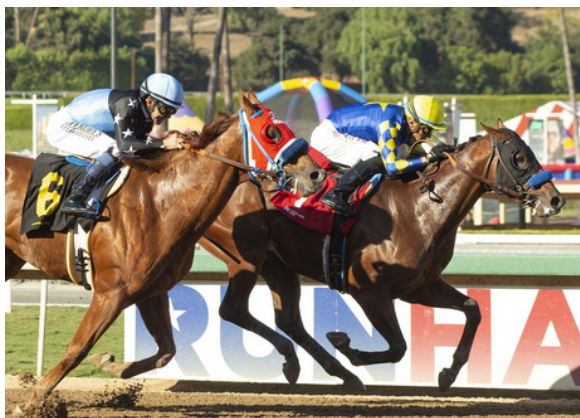
FORT WARREN dubbed a TDN Rising Star on debut!