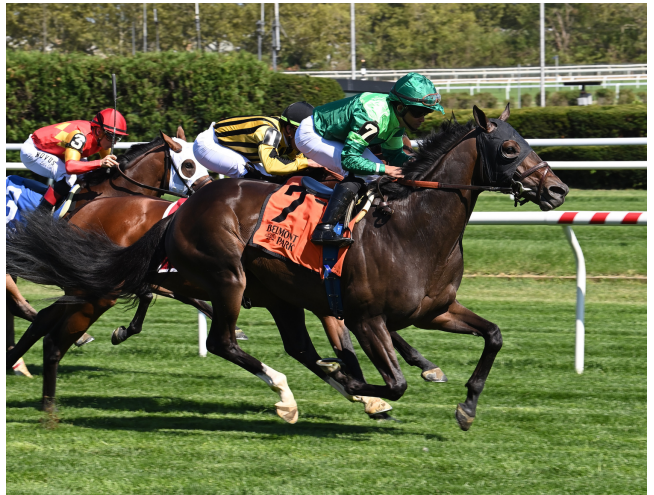
SHUTTERS wins at Belmont Park.

Last Race: 4/7/23 ALW @ AQU Finish: 2nd Trainer: Chad Brown Conditions Left: Open N1X Preferred Surface: Turf