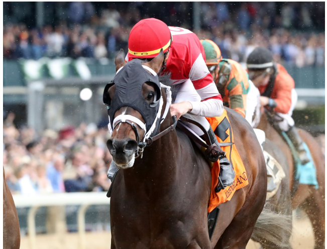
CLASS ACTOR wins on debut at Keeneland