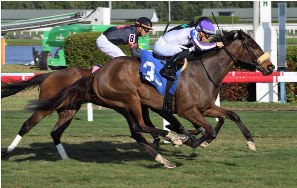
HIT THE WOAH wins at Gulfstream Park

HIT THE WOAH is a newly turned 5-year-old stakes placed mare coming into the January Sale after running career high speed figures late in her 4-year-old season. In her win at Saratoga in September, she earned a career high 5 3/4 Thoro-Graph and 90 Beyer . In her most recent start on November 27 in the Autumn Days Stakes, she had a troubled trip, getting checked hard after the break, losing position in the 6F sprint. This was her only off-the-board finish in 2022 .