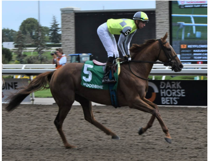
Barkin warming up before her maiden win

BARKIN is a graded stakes placed daughter of ANIMAL KINGDOM . After hitting the board in her first three starts, she had a breakthrough effort win stretching out to 10 furlongs. She broke her maiden on the turf at Woodbine by a mighty 6 3/4 lengths , earning an 83 Beyer . After a layoff, her first start as a 4-year-old was a win, matching her previous 83 Beyer. She stepped up to graded stakes company for the first time in the G2 Canadian on the turf where she ran third beaten a length and a half, earning a career high 89 Beyer .