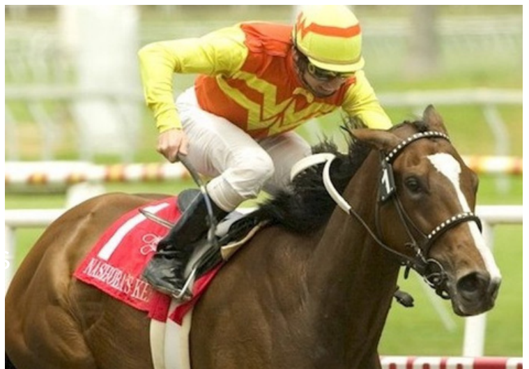
Multiple G1W Nashoba's Key

BARKIN is a 6-year-old broodmare prospect from the family of MG1W NASHOBA'S KEY . She is out of the Dynaformer mare ST. MALO'S GATE who was bred to HARD SPUN for 2022. A winner on both turf and synthetic, BARKIN is by ANIMAL KINGDOM who will be an outcross to most stallions in America.