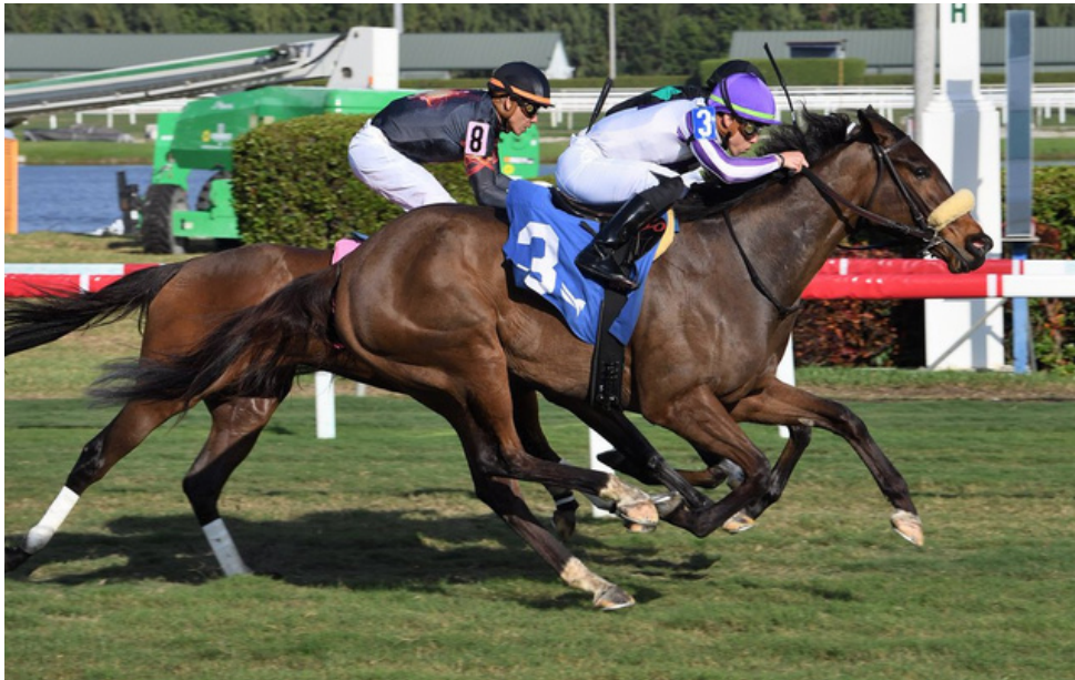
HIT THE WOAH wins at Gulfstream Park

HIT THE WOAH is a newly turned 5-year-old stakes placed mare coming into the January Sale after running career high speed figures late in her 4-year-old season. In her win at Saratoga in September, she earned a career high 5 3/4 Thoro-Graph and 90 Beyer . In her most recent start on November 27 in the Autumn Days Stakes, she had a troubled trip, getting checked hard after the break, losing position in the 6F sprint. This was her only off-the-board finish in 2022 .