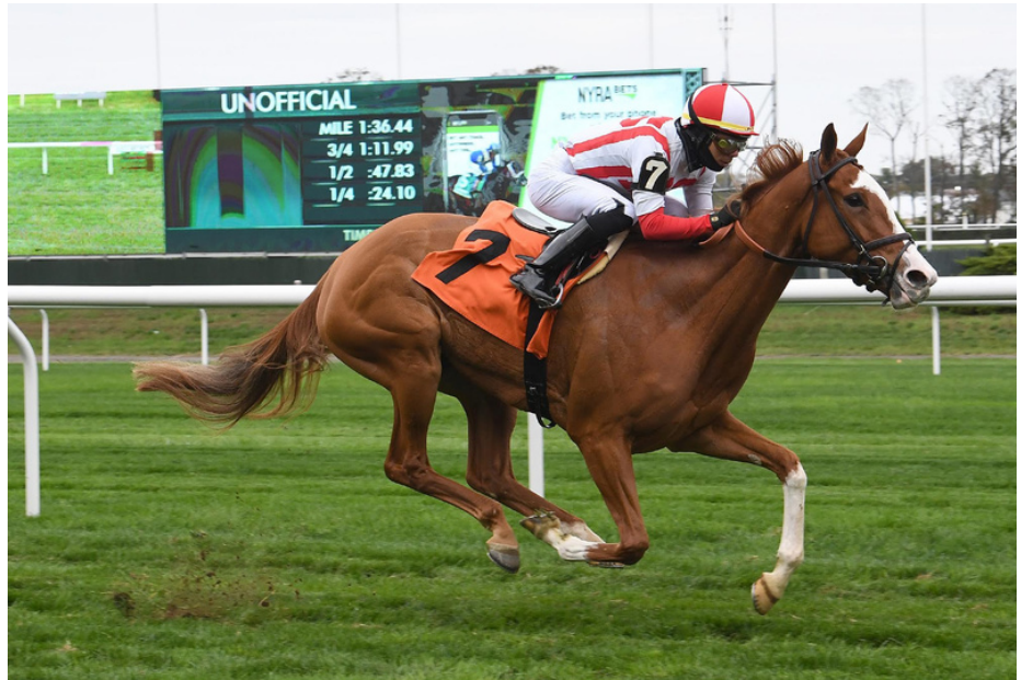
Capital Structure winning an allowance at Belmont Park.

Following her maiden win, she ran at Belmont Park finishing third after going 3 wide turning for home, running 29 feet further than the winner.