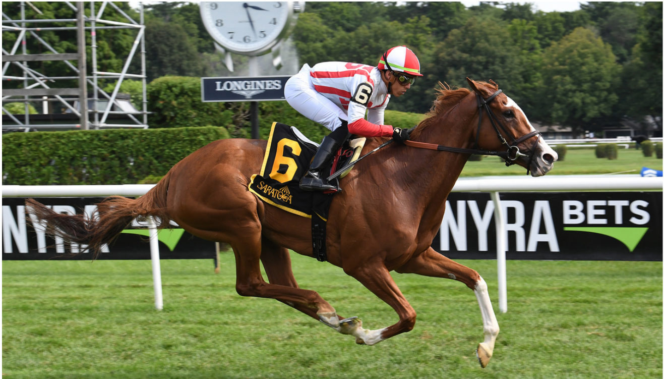
Capital Structure winning an allowance at Saratoga on July 31, 2022

➤ CAPITAL STRUCTURE won at Saratoga as a 5-year-old going 11F on the turf. Next out, she ran in the All Along Stakes at Pimlico where she encountered some bad racing luck : her saddle slipped and she was four wide turning for home.