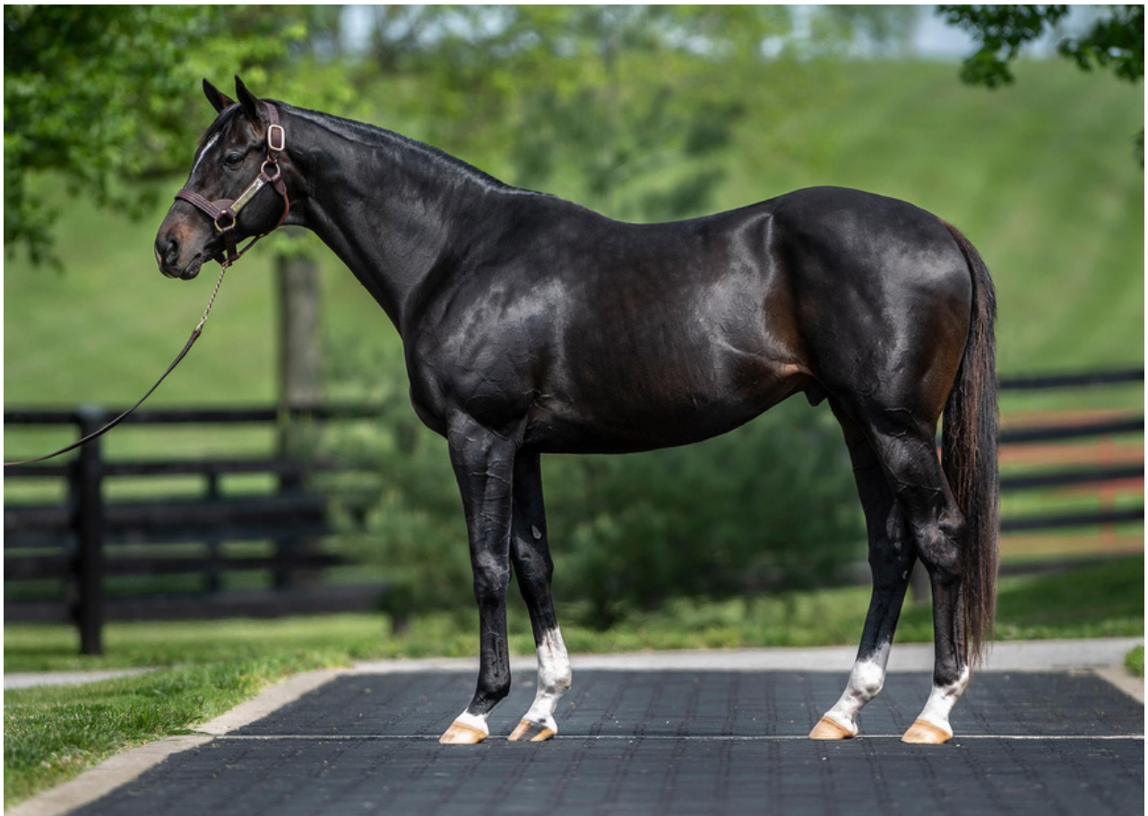
Scauri is in foal to Not This Time