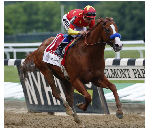
Justify winning the Belmont Stakes

Daughters of Ghostzapper are responsible for Triple Crown winner & standout sire JUSTIFY as well as Champion DREFONG , in addition to 15 other graded stakes winners and 33 stakes winners overall .