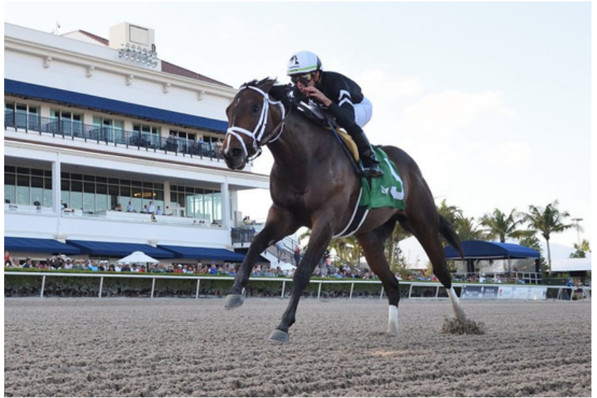
PROVOCATEUR wins the Hutcheson Stakes at Gulfstream Park this spring.

Last Race: 10/22/22 @ KEE Finish: 7th - Perryville S. Trainer: Todd Pletcher Conditions Left: Stakes, N3X Preferred Surface: Dirt