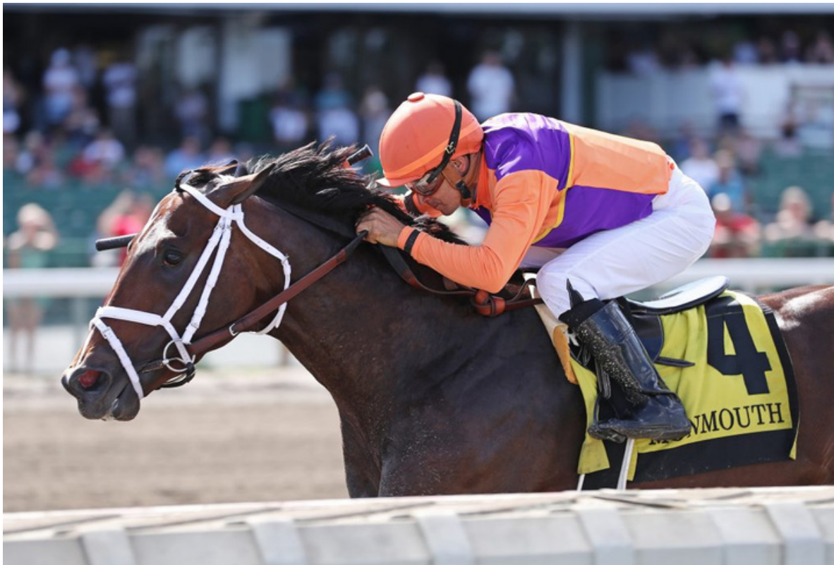
PROVOCATEUR wins the Jersey Shore Stakes at Monmouth this August with lifetime-best speed figures.

A son of the legendary INTO MISCHIEF, this colt fetched $600,000 at the Keeneland September Sale from owners Spendthrift Farm/MyRacehorse as a yearling. He is the full brother to G3 Southwest winner ONE LINER and hails from the family of G1W ALBERTUS MAXIMUS and G1W DAREDEVIL.