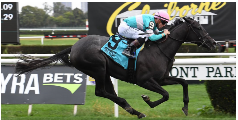
Shad Nation breaks her maiden on debut at Belmont Park