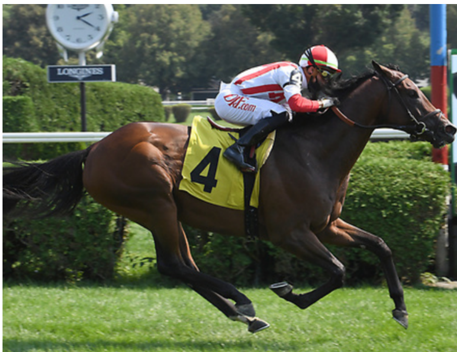
Orchestration breaks his maiden by 3 1/2 lengths in Saratoga.