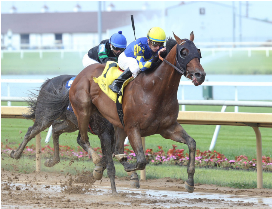
McLaren Vale winning on the slop at Indiana.