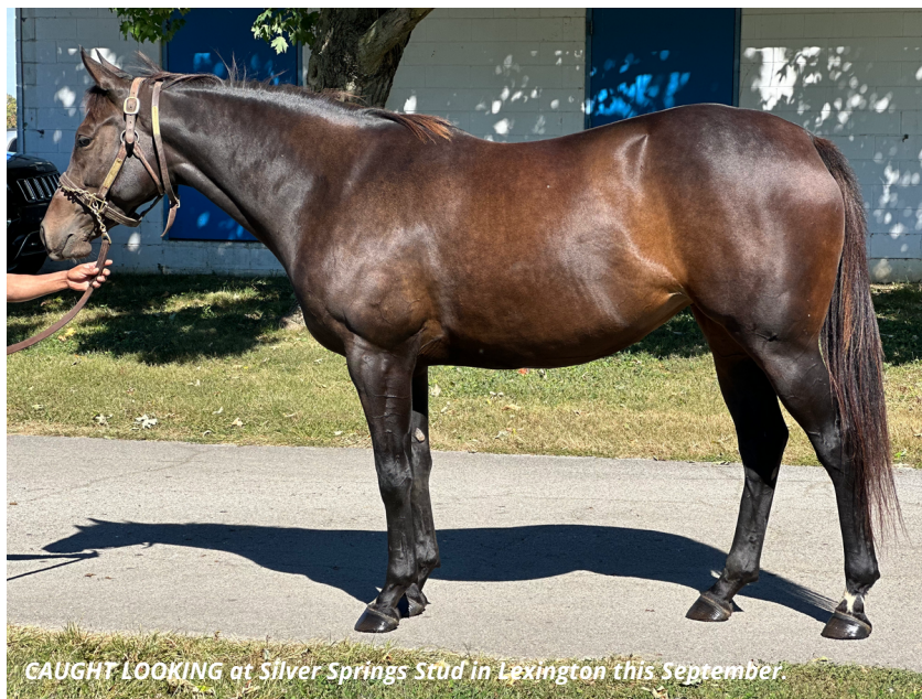
CAUGHT LOOKING at Silver Springs Stud in Lexington this September.

CAUGHT LOOKING is your chance to tap into a classic family . She is offered in foal on a March 26th cover to CANDY RIDE and the resulting foal is bred on a similar cross to her G1 Classic winning half-brother EARLY VOTING.