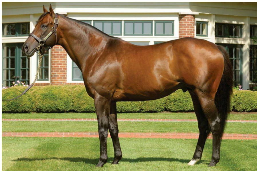
CANDY RIDE stood at Lane's End for $75,000 in 2022.

CAUGHT LOOKING is offered carrying her first foal this November. She is currently in foal on 1-cover (March 26th) to leading general sire CANDY RIDE .