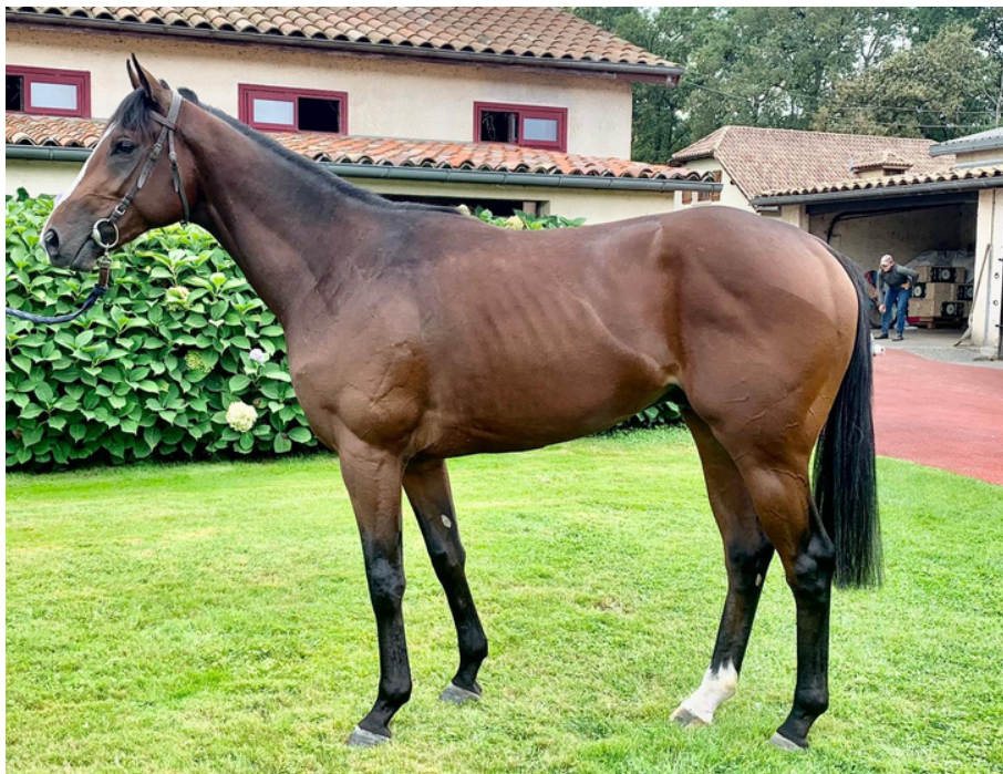
Fighter In The Win

Last Race: 10/21/22 - N1X @ AQU Finish: 2nd Trainer: Chad Brown Conditions Left: N1X Preferred Surface: Turf