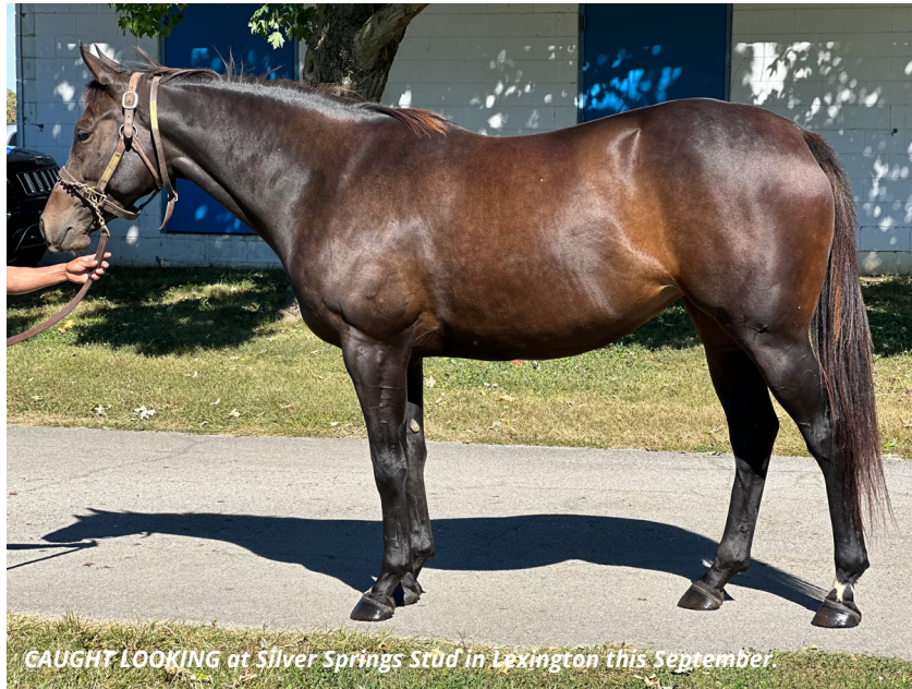
CAUGHT LOOKING at Silver Springs Stud in Lexington this September.

CAUGHT LOOKING is your chance to tap into a classic family . She is offered in foal on a March 26th cover to CANDY RIDE and the resulting foal is bred on a similar cross to her G1 Classic winning half-brother EARLY VOTING.