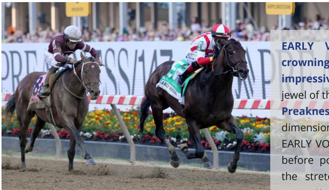
EARLY VOTING defeats likely 3-year-old champion, MGSW EPICENTER.

After a narrow 2nd in the G2 Wood Memorial where he was nailed on the wire by eventual G1 Belmont Stakes winner MO DONEGAL , the EARLY VOTING camp set their eyes on the G1 Preakness Stakes.