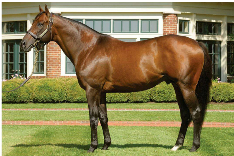
CANDY RIDE stood at Lane's End for $75,000 in 2022.

CAUGHT LOOKING is offered carrying her first foal this November. She is currently in foal on 1-cover (March 26th) to leading general sire CANDY RIDE .