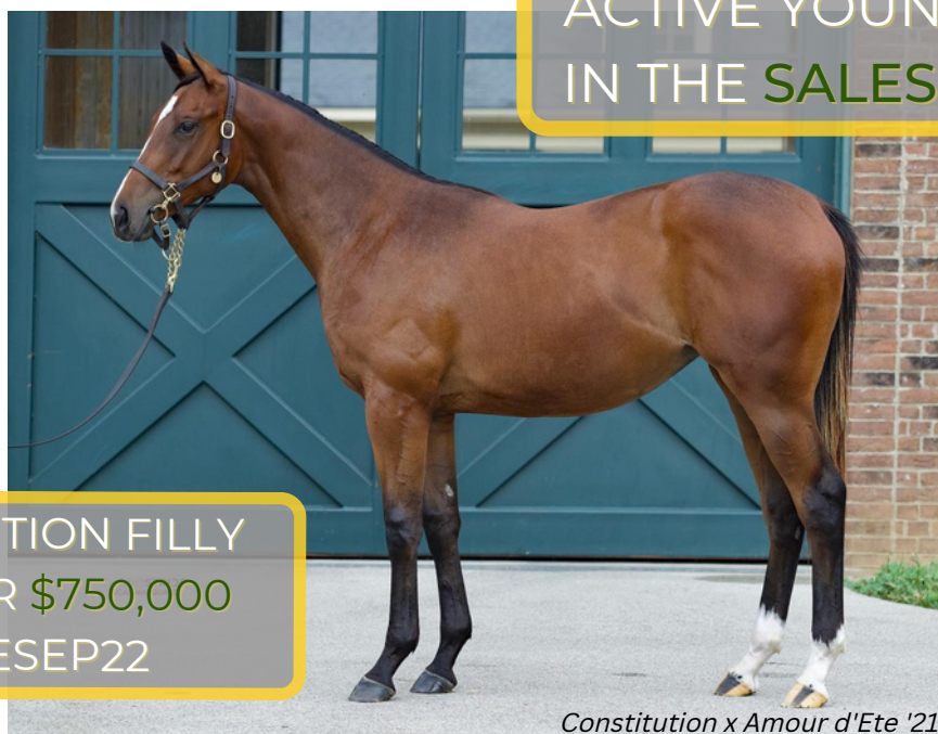
Constitution x Amour d'Ete '21

CONSTITUTION FILLY SOLD FOR $750,000 AT KEESEP22