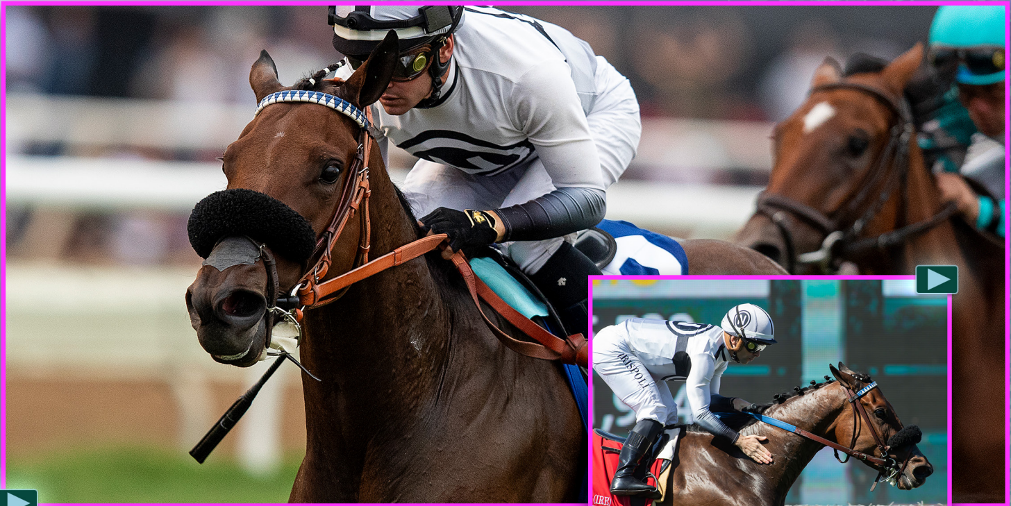
G1 DEL MAR OAKS