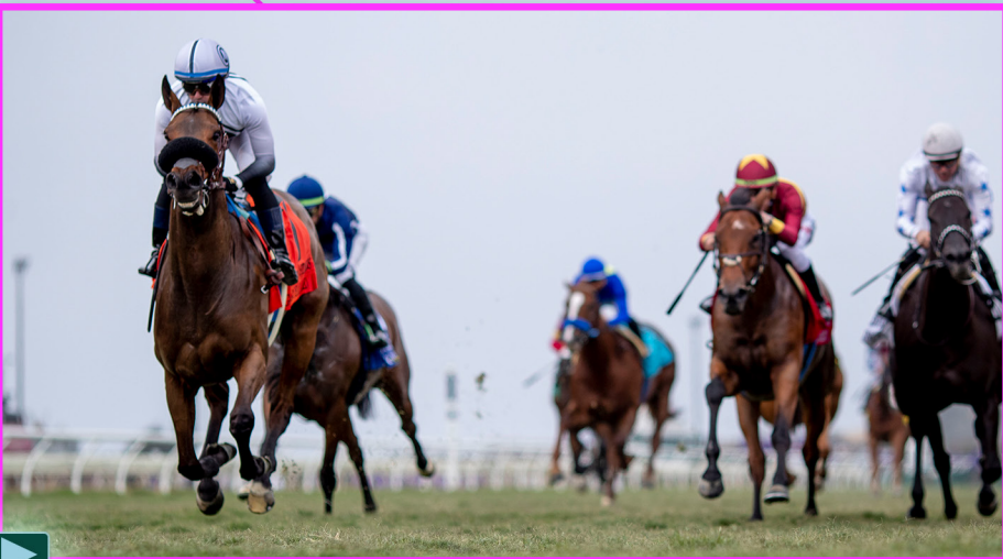
G2 YELLOW RIBBON