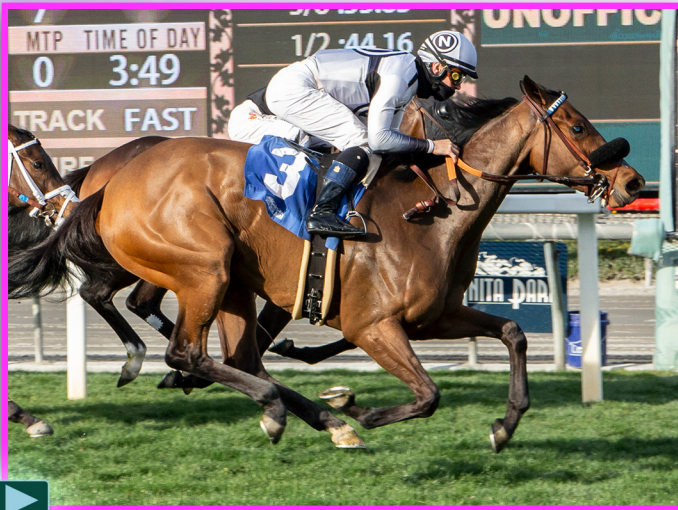
G3 SWEET LIFE

She's fired in EVERY RACE , against EVERY HORSE .