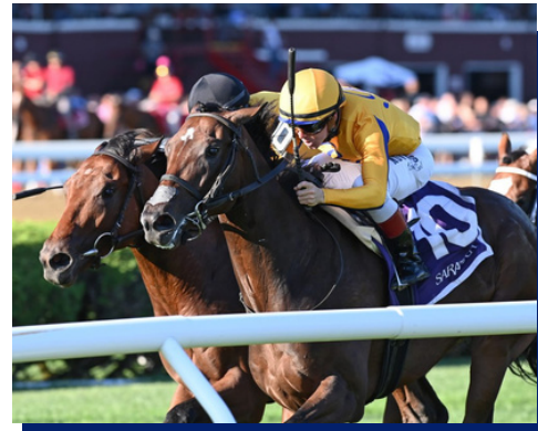
Boppy O wins the G3 With Anticipation

At the yearling sales in 2022, Bolt d'Oro's yearlings have averaged $189,454 from 44 horses sold, including his high selling colt out of Beautified who sold for $775,000 at the Keeneland September yearling sale.