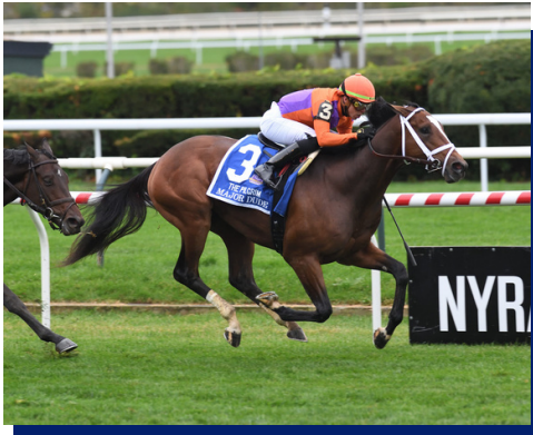
Major Dude wins the G2 Pilgrim

Thus far, Bolt d'Oro is responsible for four stakes winners and two graded stakes winners , including G2 Pilgrim winner Major Dude and G3 With Anticipation winner Boppy O.