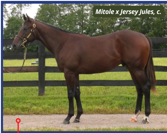
Mitole x Jersey Jules, c.