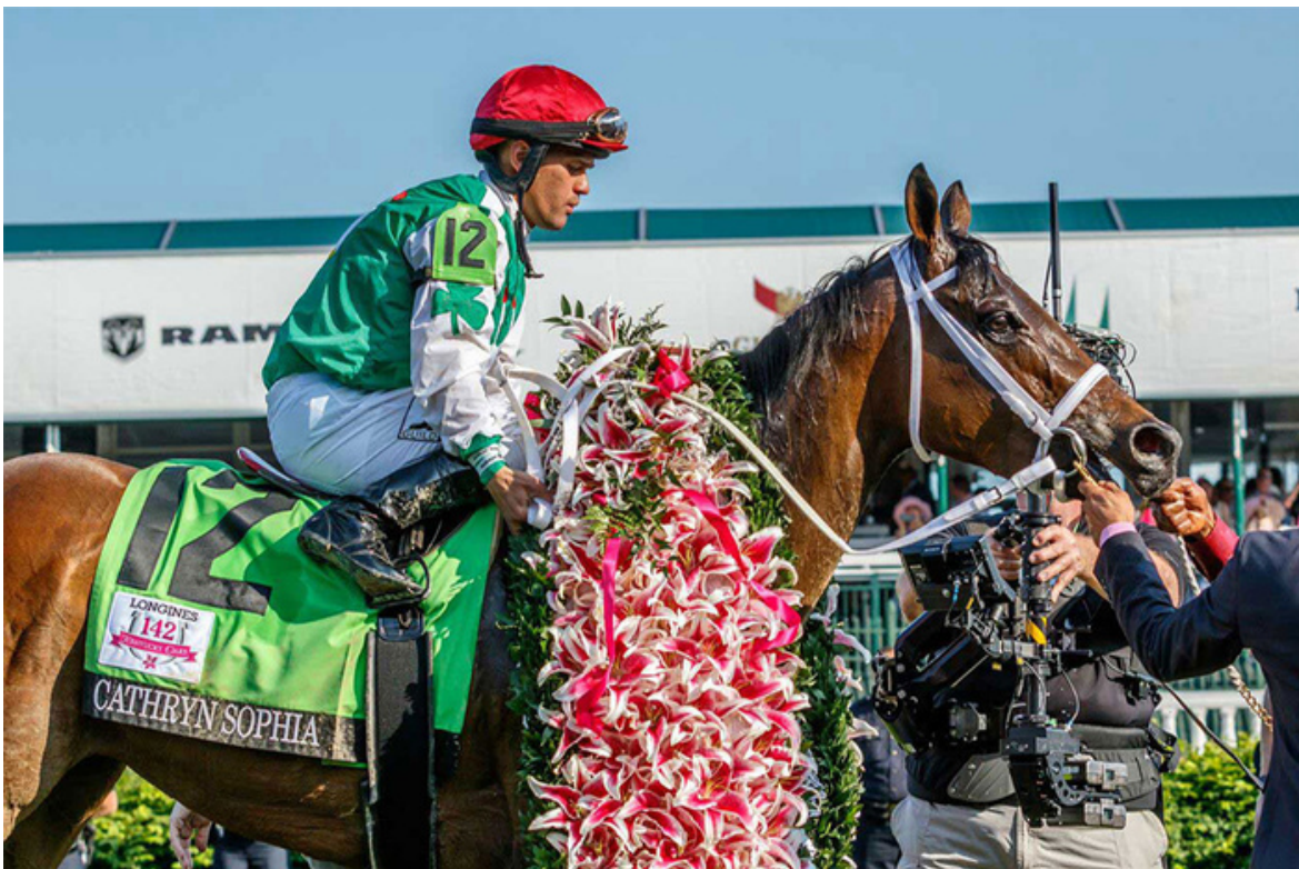
Cathryn Sophia with the Kentucky Oaks Lillies