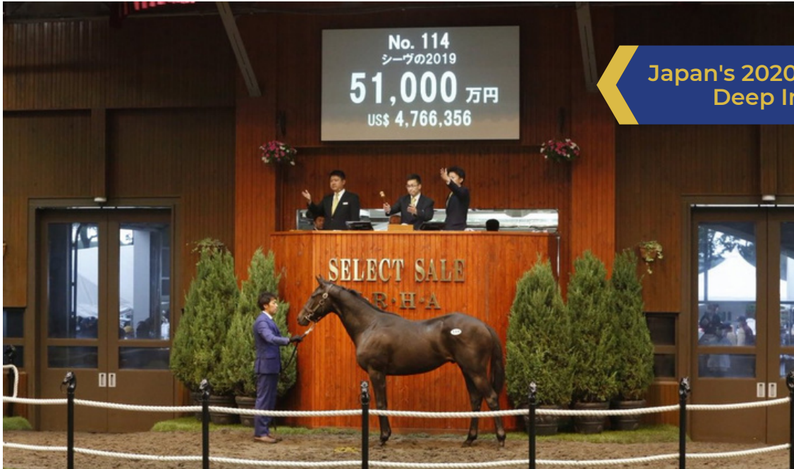
Japan's 2020 record-setting Deep Impact colt

SHEAVE , the dam of CATHRYN SOPHIA reached new heights as a broodmare in Japan at the 2020 Yearling and Foal sale. In less than 24 hours her progeny made over $6 million USD . Her yearling from Deep Impact's final crop brought a record $4,766,356 and the next day her Heart's Cry foal brought $1,857,303 .