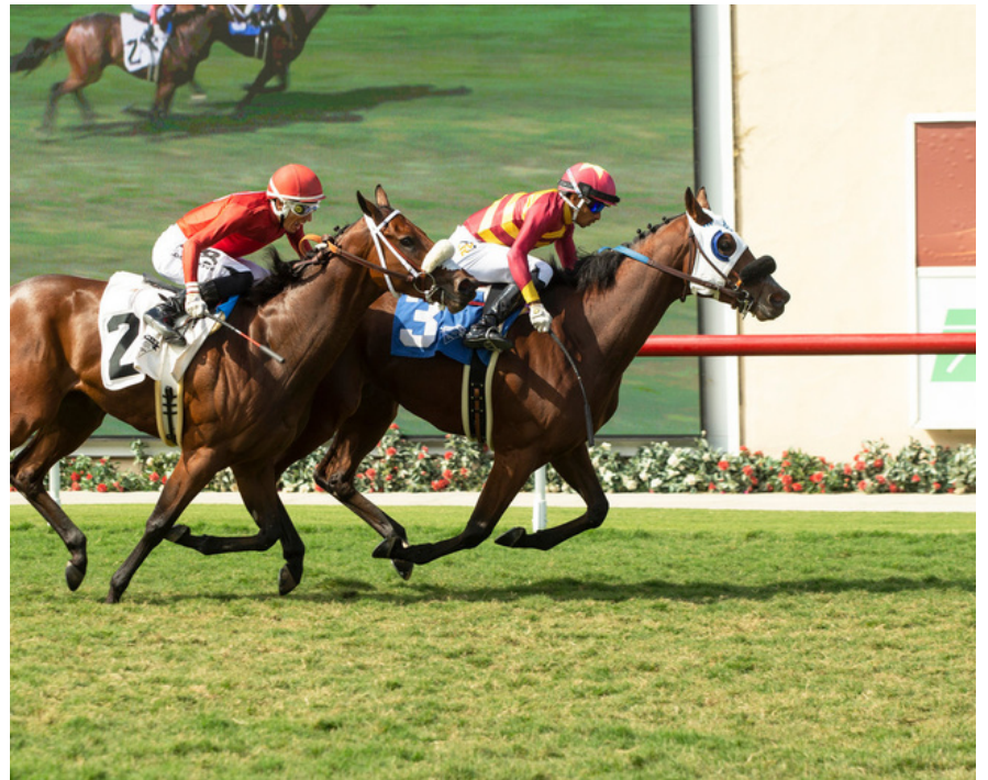
Counterparty Risk wins at Del Mar

She followed up her allowance win in the Swingtime Stakes at Santa Anita on October 9th. After a wide trip and the winner loose on the lead, COUNTERPARTY RISK made up all the ground she could to come running for second. She matched her career best Thoro-graph in this effort.