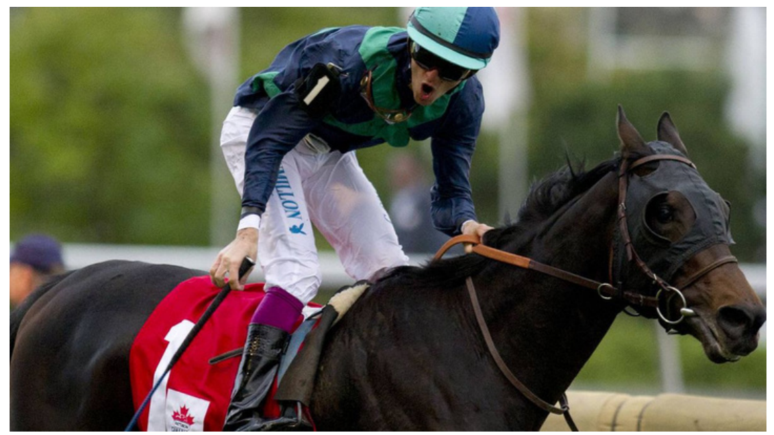
Sarah Lynx wins the Pattison International

COUNTERPARTY RISK sold for $446,799 as a yearling at Tattersalls October Book 1 - over five times the average price of AUSTRALIA yearlings sold in 2018. She is out of the 13year-old Acclamation (GB) mare ANKLET, who is a half-sister to G1W SARAH LYNX , who sold for $2.6 million at Fasig-Tipton November in 2014, and G3W STEEL PRINCE and G3W SUGAR BOY .