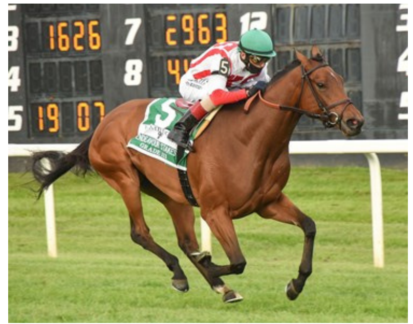
Counterparty Risk wins the G3 Endeavour at Tampa Bay Downs

This race came directly after COUNTERPARTY RISK shipped back from California after finishing 2nd in the Lady of Shamrock at Santa Anita after running the final ¼ of a mile in :22.4, 3/5 of a second faster than anyone else in the race.