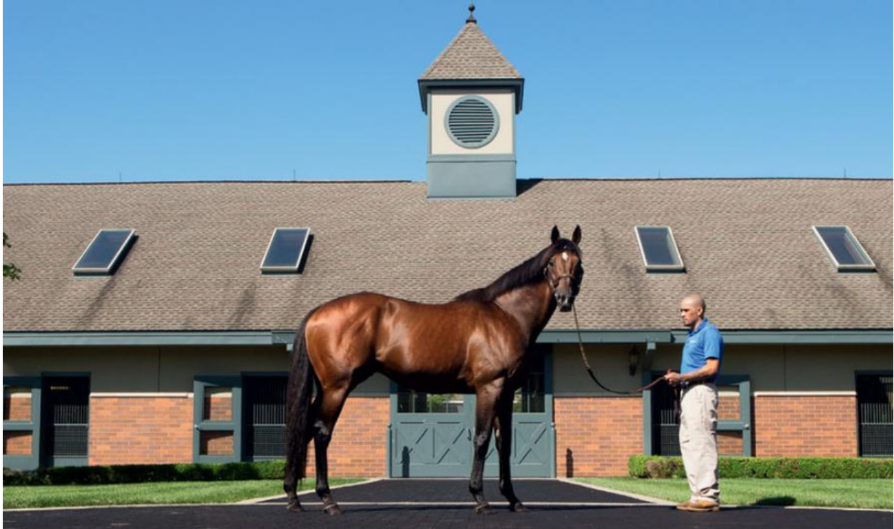
Hard Spun at Jonabell Farm

ZYDECO MAMA is by HARD SPUN , who is quickly stamping himself as a highly sought after broodmare sire . He not only has the fewest crops, but he is also the youngest stallion in North America's Top 25 broodmare sire rankings. His daughters have already produced 34 stakes winners including G1 winners in North America, Europe, and Asia .