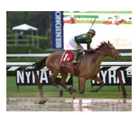
Dunbar Road wins the G1 Alabama