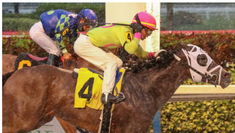
A BIT OF BOTH wins the Captiva Island Stakes.

Running over the slop in the Captiva Island Stakes in March of 2021, A BITH OF BOTH rallied late to overtake the SW MISS AURAMET to win by a half-length. ( click to view race replay ). All in all, A BIT OF BOTH defeated an astounding 34 Stakes winners throughout the course of her career.