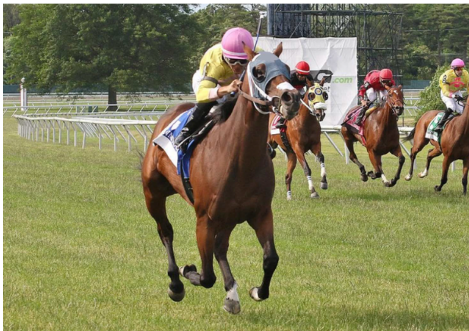
A BIT OF BOTH dominates the Honey Bee Stakes at Monmouth.

Making her turf debut in the Honey Bee Stakes at Monmouth Park in her very next start, A BIT OF BOTH responded with a 2 1/2-length score where she defeated three Stakes Winners including the G3W/G2P QUEEN OF BERMUDA.