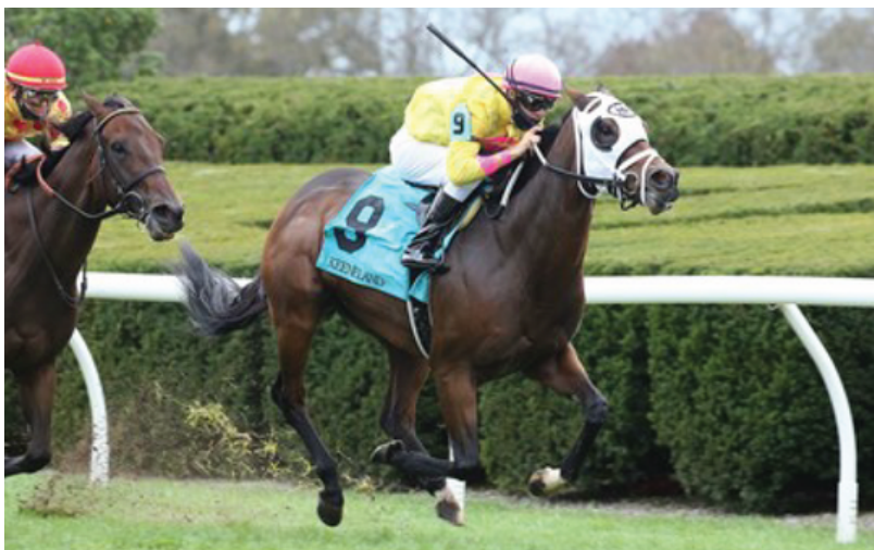
A BIT OF BOTH wins an allowance over the turf at Keeneland.

Her win in the Game Face over the dirt at Gulfstream Park gave A BIT OF BOTH her third consecutive win , a race in which she defeated SWs KARAMA and AMY FARAH FOWLER ( Click to view Race Replay ).