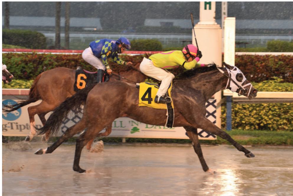
A BIT OF BOTH wins the Captiva Island.

A BIT OF BOTH possesses three key attributes desired in broodmares : precocity, versatility, and durability. She kicked off her racing career with an impressive 11 3/4-length win over the dirt and continued to race into her 5-year-old season.