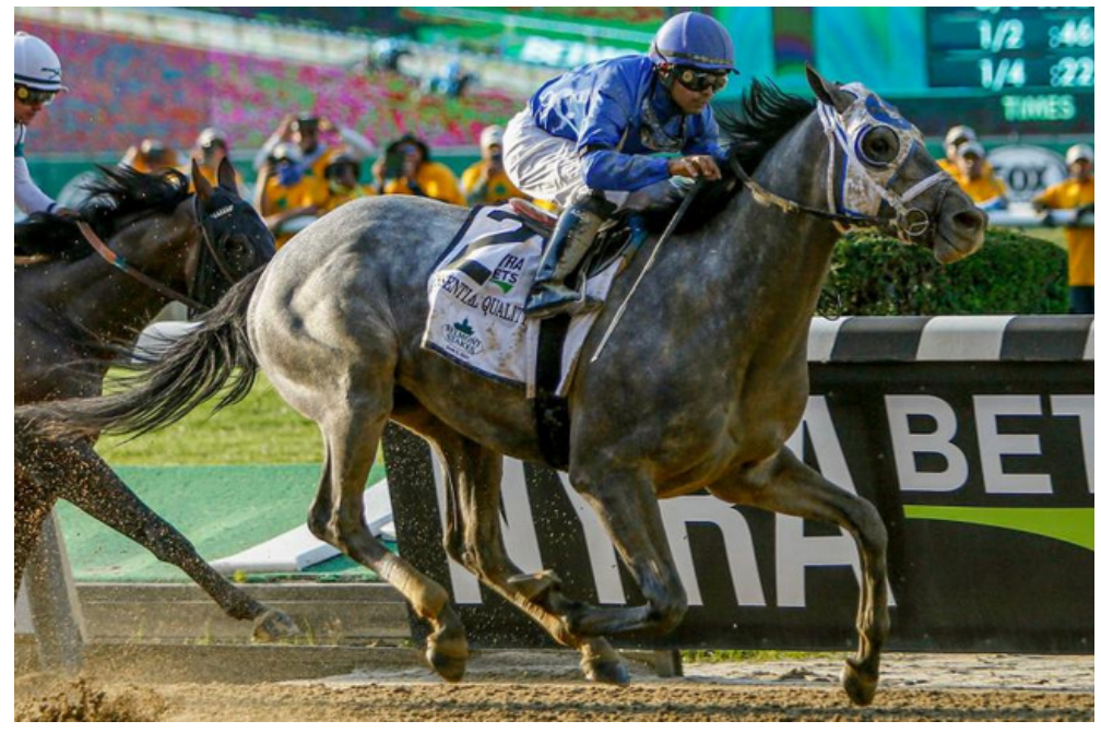
MIRA ALTA, dam of Wicked Awesome, is in-foal to ESSENTIAL QUALITY (Tapit).

WICKED AWESOME is the half-sister to the $200,000+ earner and Graded Black Type Placed runner WAR STOPPER (Declaration of War). She is also the half-sister to PROMISE KEEPER, winner of the G3 Peter Pan.