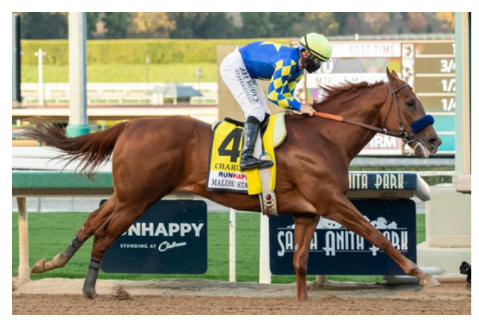
CHARLATAN dominates the G1 Malibu.

This Stakes Winning/Grade 3 placed mare is offered in-foal on 1-cover to the brilliantly fast CHARLATAN. She hails from a deep family of Graded Stakes winners and Graded Stakes producers of dirt routers. While she had the stamina to win going 2-turns on the dirt, she also had speed, earning several GSW quality figures.