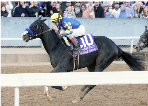
NEWGRANGE wins the G3 Southwest Stakes at Oaklawn.

Last Race: 2/16/22 G2 Rebel @ OP Trainer: Bob Baffert Conditions Left: Stakes Preferred Surface: Dirt