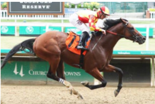
PERFECT FLIGHT breaks his maiden at Churchill Downs last out.

Last Race: 6/26/22 MDN$75k @ CD Trainer: Rodolphe Brisset Conditions Left: Alw-N1X, STR Preferred Surface: Dirt