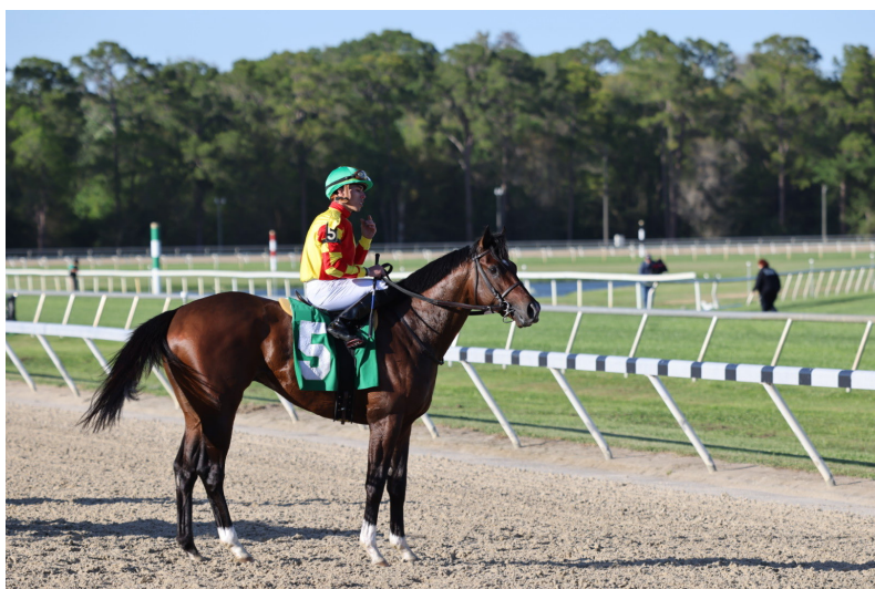
HEAVEN STREET en route back to the winners circle after taking the Columbia Stakes at Tampa this spring.