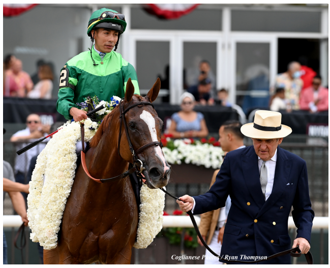
MG1W REGAL GLORY, seen here after winning the 2022 Just A Game, is out of a More Than Ready mare.

MORE THAN READY is emerging as a top broodmare-sire with his daughters producing 133 Stakes winners and 60 Graded Stakes winners. In 2022 alone, his daughters have produced 8 Stakes winners headlined by turf superstar and MG1W REGAL GLORY.