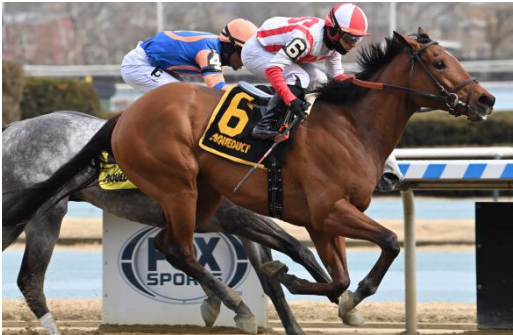
ELECTABILITY breaks his maiden against NYRA MdSpWt company in his first start this year.