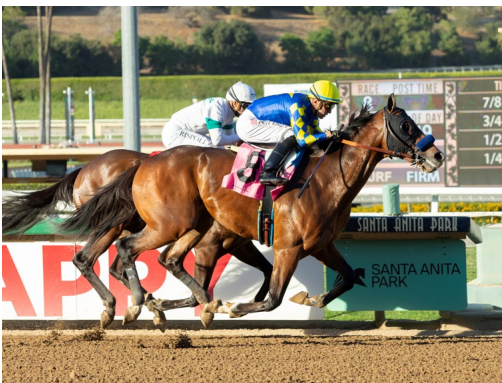
BAROSSA breaks his maiden at Santa Anita.