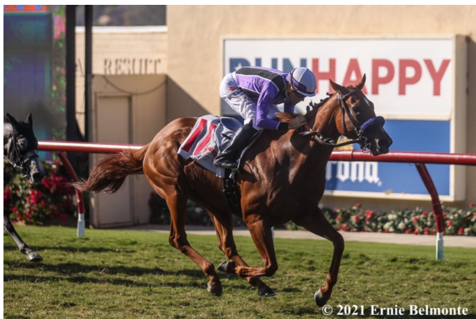
NORMA JEAN B. beats four SWs including G1W QUEEN GODDESS in a Del Mar allowance last September.