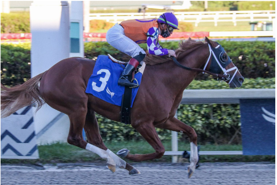
War Stopper wins an allowance race at Gulfstream in December of 2020.