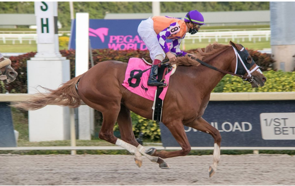
War Stopper wins an allowance race at Gulfstream Park.

Last Race: 4th, AOC-N3X Track: Keeneland